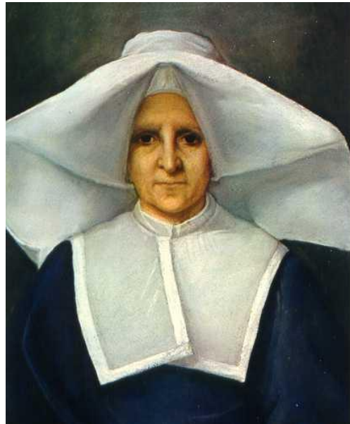
Sr. Rosalie Rendu (1786-1856)

Beatified: August 22, 1997 Feast Day: September 9